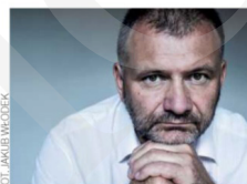
• Gdy sędzia Żurek zaangażował się w debatę na temat reform, zainteresowały się nim służby

Wczorajszy wyrok potwierdził, że „reforma” KRS odbyła się z naruszeniem prawa. Nie istniała bowiem żadna procedura pozwalająca usunąć z Rady sędziom odwołując się od tej decyzji. ETPC orzekł, że skutkowało to „naruszeniem samej istoty prawa do sądu”.