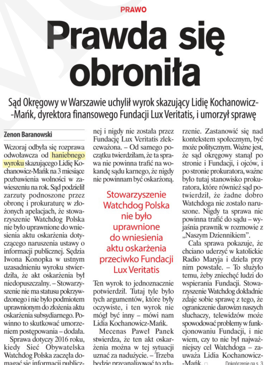
Figure 12. ND – “judges perform their duties, i.e. they adjudicate – in a right way (as expected) or in a wrong way (contrary to the expectation)”