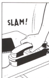
Fig 5. Tomine, A. (2012). Shortcomings . London: Faber and Faber, p. 73.