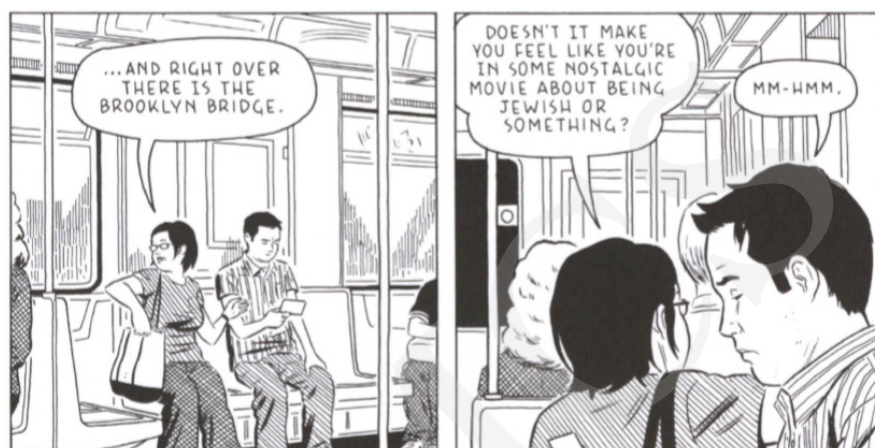
Fig 20. Tomine A. (2012). Shortcomings . London: Faber and Faber, p. 79.

A similar reference is also made by Kim, when she reflects on living in New York: