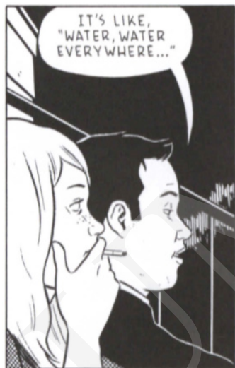
Fig 22. Tomine A. (2012). Shortcomings . London: Faber and Faber, p. 55.