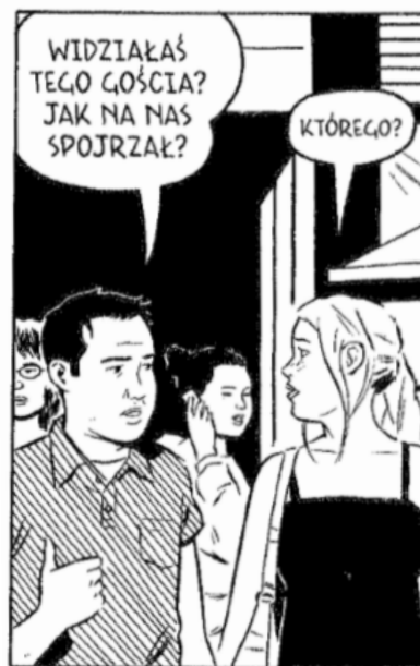
Fig 7. Tomine, A. (2010). Niedoskonałości . Trans: Murawska, A. Warszawa: Kultura Gniewu, p. 68.