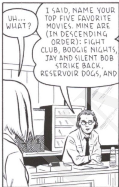
Fig 16. Tomine A. (2012). Shortcomings . London: Faber and Faber, p. 20.

Apart from the Zanettin's 'articulatory grammar' and the constraints it imposes, the language and cultural references pose challenges in Shortcomings . Allusions to other works appear; some of them are quite straightforward, as in the following frame: