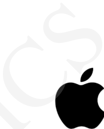
Figure 1b. Apple Inc. logo (© Apple Inc.)

It is clear that this piece of promotional material is formed upon the popular proverb An apple a day keeps a doctor away . Crucially, the key word apple has a double meaning. It obviously alludes to the proverb, while on the second look one may uncover the hidden, intended meaning, namely a reference to Apple Inc. multinational technology company which specialises in iPhones, iPads and other electronic devices (cf. its logo in Figure 1b). Lambton Mall tries to encourage prospective buyers to come and do their shopping in its centre because every customer has a chance to win one of many Apple themed accessories. Through this ingenious marketing trick, copywriters strengthen the advertisement's potential. Besides, allusions to tradition and heritage from former generations augments the trust in the company's potential customers, which in turn encourages them to do the shopping.