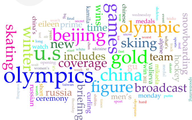
Figure 2. Words with frequency greater than 3 in the New York Times

As shown in the figure, the high-frequency words in the People's Daily are closely related to the research topic. The most frequently used term is literally “Beijing 2022 Winter Olympics” itself. Additionally, there are no negative terms observed in the figure.