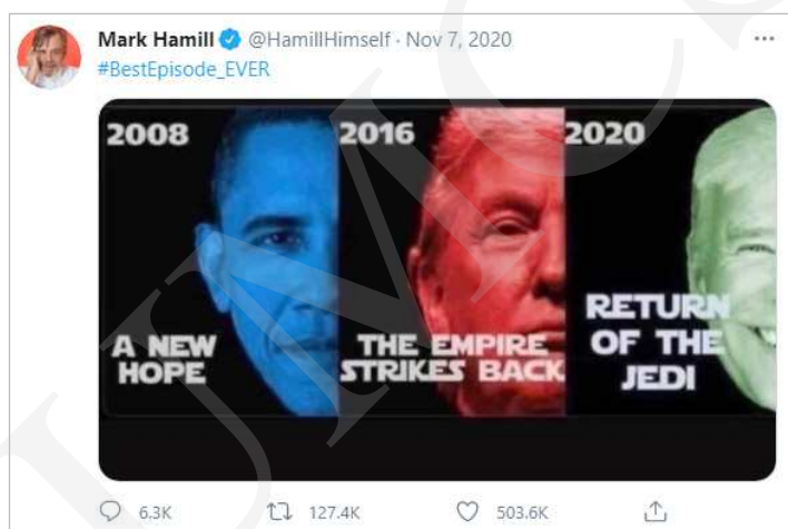
Fig. 2: The titles of the original Star Wars trilogy imposed on the American presidents from 2008 to 2020 (@HamillHimself, 2020).

Hence allusions to popular movies and TV shows form the base of many memes framing the weeks of the election week. Particularly references to such staples of geek fan culture as Star Wars , Marvel , and Game of Thrones were abundant, with even Mark Hamill, the actor playing Star Wars ’ Luke Skywalker, sharing a highly popular meme after the election that was liked 500k times: