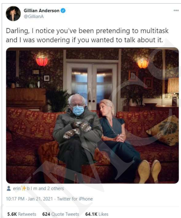
Fig. 6: Celebrities such as actress Gillian Anderson contributed to election memes spreading, sharing variations of “Bernie’s Mittens”

depicted as “‘cool’ and culturally informed both in memes and ... fan writings” (2020) which are widely created and shared. This relatable image soon lost all political significance, becoming seemingly a floating signifier without clear meaning or reference. The iconic photograph of Bernie in his mittens was inserted into anything – from pop cultural imagery such as the Totoro meme 6 to the NASA rover landing – and reproduced in many media, be it deep faked video clips or as a crocheted doll.