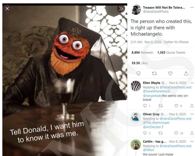
Fig. 3: Example of Gritty meme with high intertextuality by @IskraDavidPhoto (2020)

While the framing is similar to the previously discussed examples, in memes such as this 3 , several elements come together to create the multi-layered joke of the meme: Gritty's head is super-imposed on Olenna Tyrell, a character from HBO's Game of Thrones series. The show's quote is slightly altered to refer to Donald Trump, once again taking the place of a hated villain, this time Game of Thrones ' king Joffrey. Denisova (32) points out that "memes are coded messages and therefore can be confusing for various people: members of the audience may have varying abilities and skills to read the 'code'" in such cases. Here it is both necessary to know the context of the quotes – Olenna admitting to the murder of a tyrant king – and the event it references, with the implied metaphorical murder being Trump's loss of the election, which was attributed to the votes of leftist Philadelphians, as Pennsylvania flipping blue was seen as the key event cementing Biden's victory, metonymically referenced through Gritty.