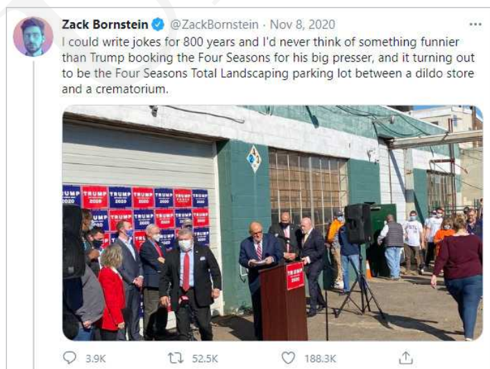
Fig. 4: A photograph of Trump’s press conference, commented on by @ZackBornstein

Another way Trump’s loss of the election was celebrated in meme-format occurred in the form of event references, such as the slow vote counting in Nevada (e.g. Haylock 2020) or in response to Trump’s final press conference. After it was announced that he would be giving a press conference not in the Four Seasons hotel but Four Seasons Total Landscaping parking lot, many memes were created that alluded to this event.