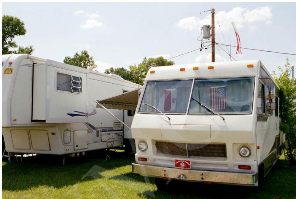
Figure 11. Mobile Home in the Ethnic “Neighborhood” displaying Polish American symbols.

In his critical work on cultural dimensions of globalization, Arjun Appadurai (1996) distinguishes between culture and the cultural. While culture is associated with a static conception of a people associated with specific traits, the cultural refers to situated differences, contrasts, and comparisons “that either express, or set the groundwork for, the mobilization of group identities” (13). Appadurai’s distinction expresses the fluidity of identity associated with diasporic movements. Describing complex repertoires of images, narratives, and ethnoscares, he notes that ethnic images are diasporic. Appadurai recognizes the synergistic and serendipitous nature of the flow of representations. I would argue that this is the nature of the symbolic landscape from which Polish American polka people draw to fashion their group identity. In this landscape, symbols of farm prosperity, twentieth century nationalisms, hybrid music, Polish folk culture, and American ethnic urbanism all emerge as a field from which polka people craft their sense of identity and belonging. This sense of Polish American identity is formed in the space of a mobile community of polka music fans who recreate a movable Polish American “neighborhood” on the festival circuit.