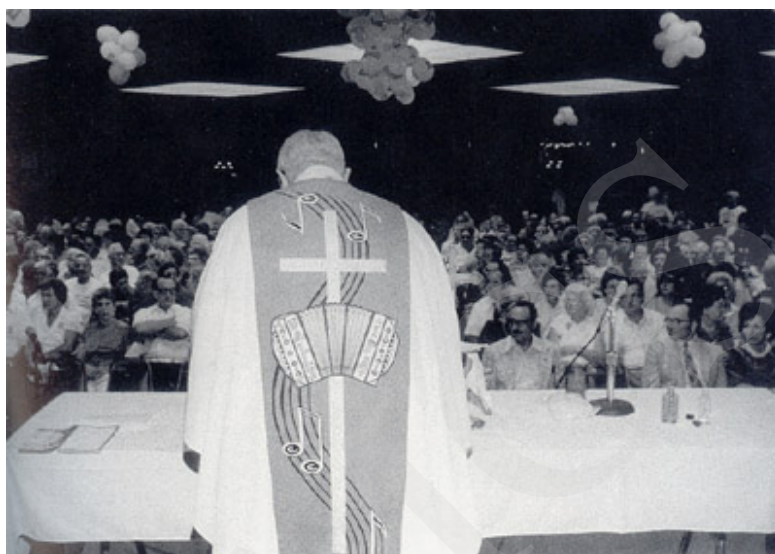
Figure 3. Priestly vestments at the International Polka Association's Polka Mass, 1983.