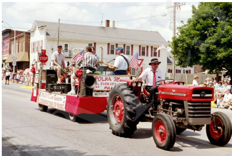
Figure 9. A postmodern pastiche of ethnic symbolism in Pulaski’s Polka Parade, 2004.

The Pulaski polka parade is a virtual feast of hybrid ethnic symbolism. [See Figure 9] In a stunning moment of visual pastiche, an antiquated American tractor was driven by a farmer in a Górale [Polish mountaineer] hat, pulling a wagon that carried polka musicians. The wagon was decorated by American flags and a hand-written sign claiming “polka music evolves in Pulaski.”