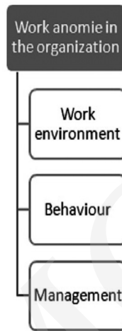
Fig. 4. The Model of the Three Forces of Employee Anomie