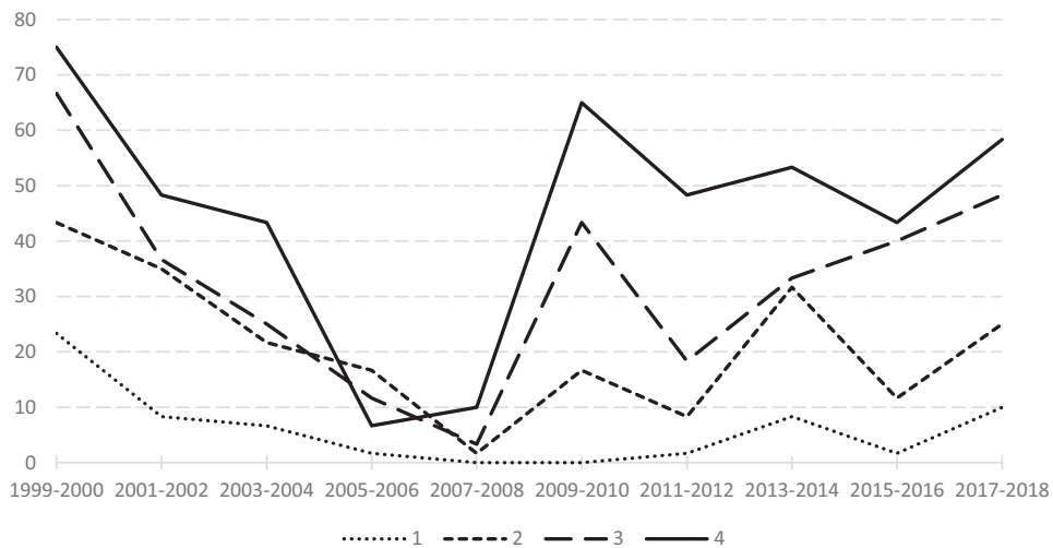
Figure 2. The average percentage of cases in which the returns were normally distributed, taking into account all tests performed and all indexes presented for each two-year sub-period and each returns' interval