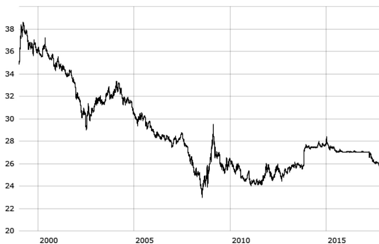
Figure 3. Fluctuations in the crown's rate in relationship to the euro, 2000–2017