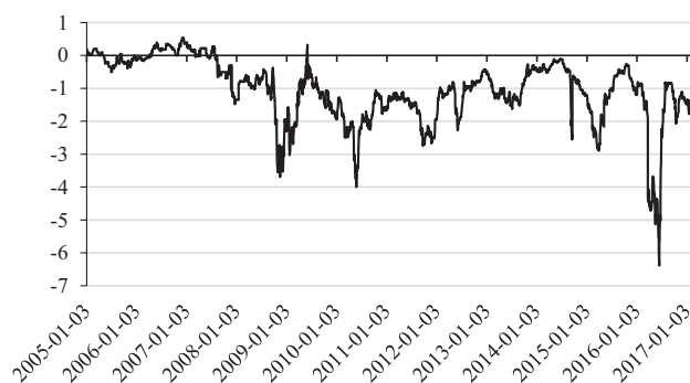
Fig. 2. A 25-delta risk reversal of USD/GBP exchange rate during the period 01.2005–01.2017

Another event that highly affected the value of Japanese currency was Pacific typhoon (Fig. 1, IV) that took place in September 2011. Despite the natural disaster in Japan, market participants placed higher probabilities to large appreciation of Japanese yen. As a result, the currency became stronger although there were no sufficient fundamental reasons for it. It is worth emphasizing that, since the mid-1990s, there have been 12 episodes during which the value of Japanese yen has increased by more than 6% (in nominal terms) within one quarter [Botman, Kang, 2015]. Moreover, these periods often coincided with events outside Japan. It shows that the value of Japanese currency is highly affected not only by economic, fundamental factors, but also by global changes in investors' mood, risk perception and global risk aversion.