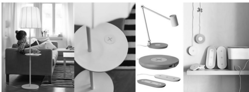
Figure 5. Internet of Things – IKEA