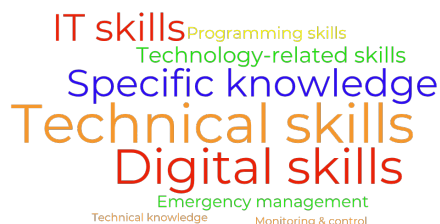
(b) functional competencies