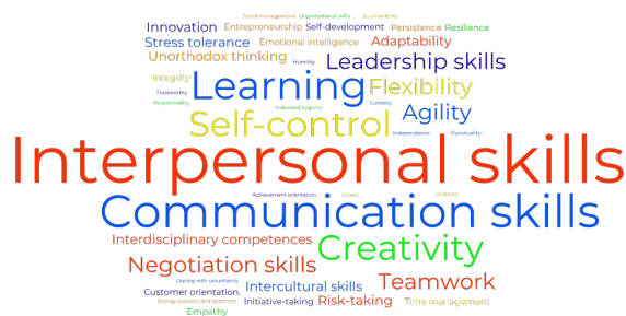
(c) social competencies