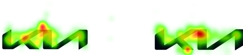
Figure 16. Eye tracking results for Kia logos in the form of a heat map for research groups A and B

The heat maps of the two groups of subjects are similar. The increased interest in group B for the lower point in AOI area 1 may be due to the way the elderly made comparisons of the repetition of elements, the letter “K” versus the combined letters “I” and “A”, identifying the lower leg of the letter “K” as the discordant element and distinguishing the two areas (Figure 16).