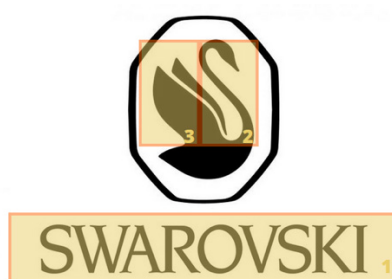
Figure 5. AOI for the Swarovski logo