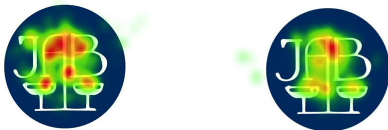
Figure 10. Eye tracking results for the logotype of the company J.A. Baczewski in the form of a heat map for research groups A and B