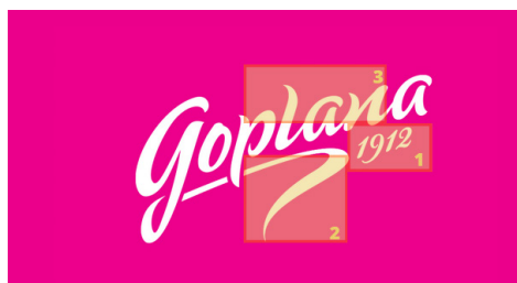
Figure 3. AOI for the Goplana company logo