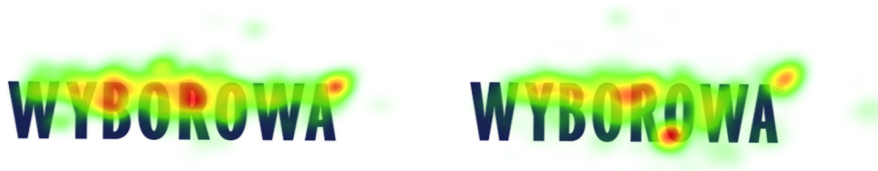
Figure 12. Eye tracking results for the Wyborowa logotype in the form of a heat map for research groups A and B