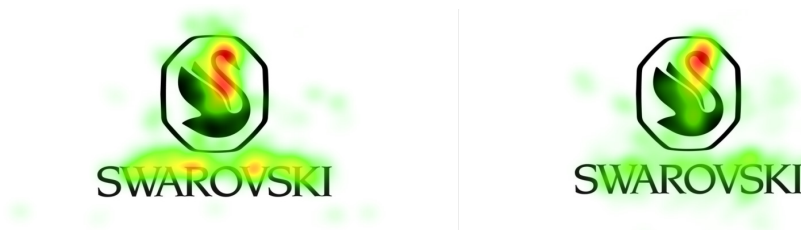
Figure 6. Eye tracking results for Swarovski logos in the form of a heat map for study group A and B