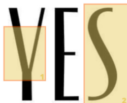
Figure 7. AOI for the YES logotype