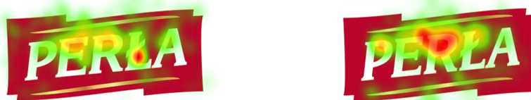
Figure 20. Eye tracking results for the PERŁA logotype in the form of a heat map for research groups A and B