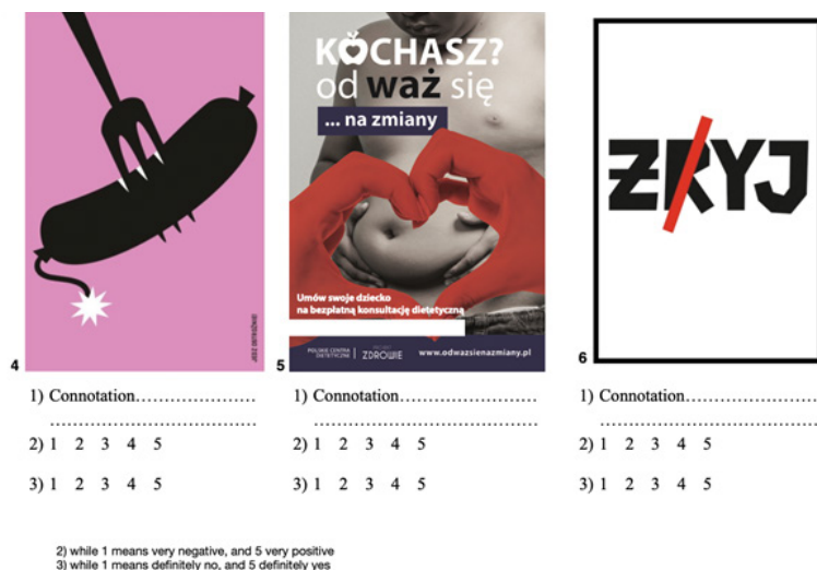
Figure 2. Focus group interview, connotation test form for the participants (p. 2)

Note: Translation of text from poster No. 5: "If you love, dare to change". Make an appointment for a free dietary consultation for your child. 1 Translation of text from poster No. 6: "Live / Devour". 2