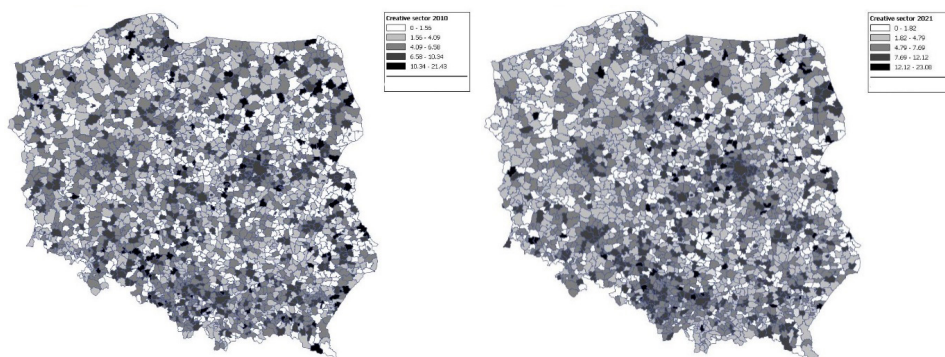
Figure 3. Spatial diversification of new registered creative sector entities in analyzed years