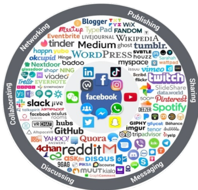
Figure 1. The social media landscape in 2020

Social media offers many opportunities to engage in dialogue with customers, as shown in Figure 1. Every year there are more and more such methods, however, it should be remembered that some of the presented ones are not yet available in different countries. Interestingly, Facebook and Twitter are the leaders in social media. A large number of Facebook users use it on average more than 30 minutes a day, and there are also other platforms such as Twitter, Instagram, Kik or Snapchat.