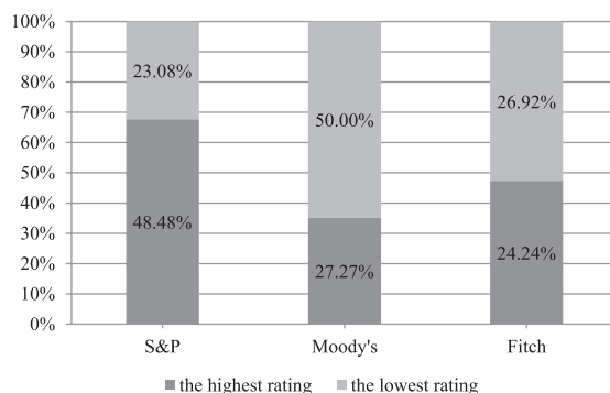
Figure 3. The highest and the lowest rating awarded by agencies

Furthermore, the analysis of the ratings awarded to the issuers by individual agencies was carried out, in order to check which agency gave the highest and the lowest credit ratings. For this purpose, the issuers which received the ratings from two or three agencies were analyzed. The issuers which received the rating only from one agency were excluded from this sample. The analysis does not also include the situations where the assessment of the agencies was the same.