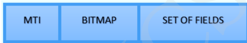
FIG. 2. Structure of ISO 8583 message

The whole standard is defined in ISO 8583 Financial transaction card originated messages Interchange message specifications. It is the binary protocol defined by International Organization of Standardization and intended for the systems that exchange electronic transactions made by cardholders using payment cards. ISO 8583 defines a communication flow and a message format so that different systems can exchange these transaction requests and responses [5]. Fig. 1 presents the structure of ISO 8583 message.