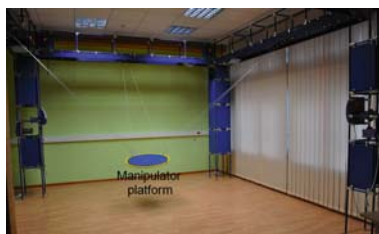
Fig. 3. The photo of described cable-driven platform.