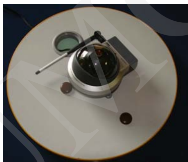
Fig. 4. The photo of the assembling board with the IP camera.

The cable driven platform has the form of the circumscribed circle about the equilateral triangle. The platform is adapted for installation of different work equipment.