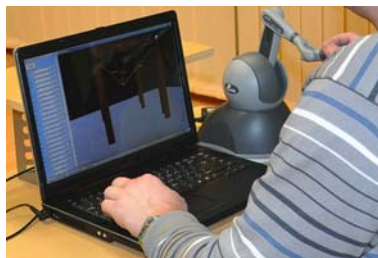
Fig. 5. The photo of the computer screen with the application dedicated to control the manipulator platform.

In the other screen window or on the second computer screen the camera image is displayed. The use of the second screen is not a problem since in practice, today each notebook is equipped with video output for an external computer monitor and a computer operating system is ready to use it.