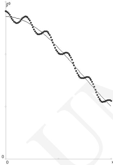
Fig. 2. The exact solution and \tilde{y}_i^0 for l = 2, T = 1, \beta_0 = 0.5, E_S = 10^{-1}, h_i^0 = 0.02.