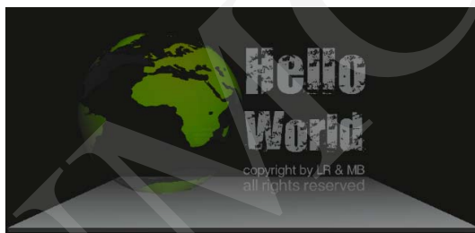
Fig. 5. A complex exhibit with an animated rotating object and a column of text labels.

The above line creates a Slide exhibit, which will contain a title and a bullet list in a column. The Slide constructor creates Label objects out of the string constants and determines their size. The title will be automatically resized to take up the whole exhibit width and the bullets in the list will be resized to have the same font size.