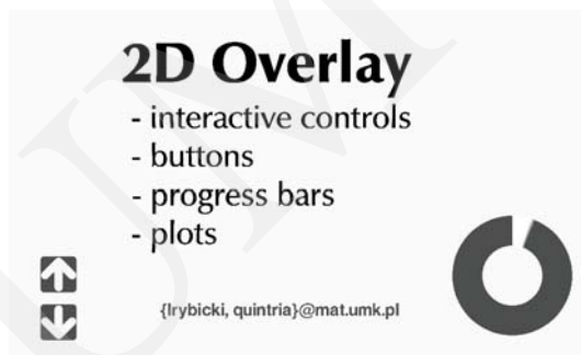
Fig. 4. Presentation of the 2D Overlay: two buttons, a static label and a circular progress gauge to-gether with a slide exhibit.

up.onClick = &display.camera.forward; down.onClick = &display.camera.back;