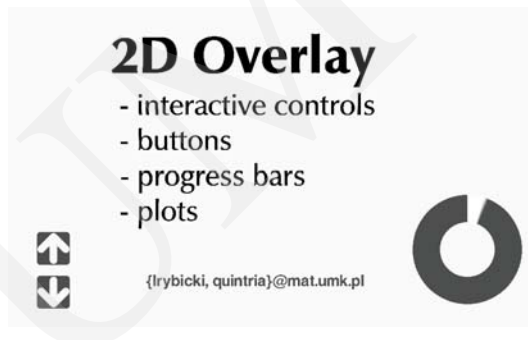
Fig. 4. Presentation of the 2D Overlay: two buttons, a static label and a circular progress gauge to-gether with a slide exhibit.

up.onClick = &display.camera.forward; down.onClick = &display.camera.back;