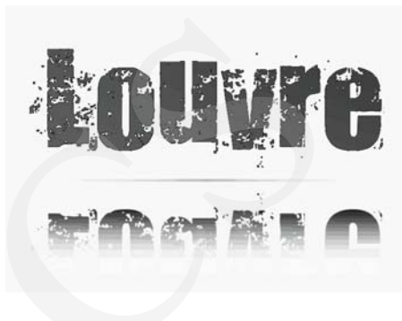
Fig. 1. The project logo as an exhibit.

The rest of the paper is organized to describe the LOUVRE project from different points of view: the following section contains technical information about the programming library, including hardware and software requirements. Section 3 describes how LOUVRE-based applications can be interacted with – the end user point of view. Section 4 contains basic information on how to use LOUVRE for scientific visualization and how to add new types of objects. Section 5 discusses the relation of LOUVRE to other similar tools. The paper is concluded by a discussion of the strengths and weaknesses of this form of visualization, as well as possible applications and future development.