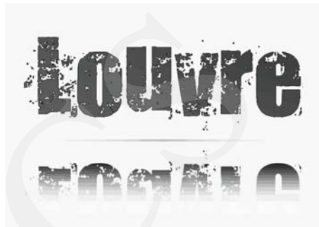
Fig. 1. The project logo as an exhibit.

LOUVRE has been implemented in the D language [3], which is a relatively new programming language quickly expanding its programmer base, especially among game programmers, due to its numerous features and speed of execution. The same reasons appeal to researchers, who need fast platform-native executables written with a concise and legible code. The D language is currently the topic of two international conferences and is taught in universities, including one in Poland – Nicolaus Copernicus University. There are two D compilers: DMD, which is made by the main developer of D. Walter Bright and GDC, which is part of the GNU Compiler Collection and has been chosen for compiling LOUVRE due to its multi-platform compatibility and standards compliance. LOUVRE works with both standard libraries available for the D language: Tango and Phobos.