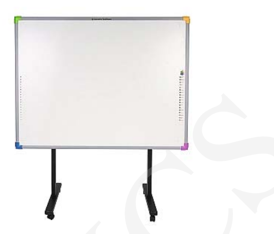
Fig. 1. An interactive whiteboard - Interwrite DualBoard.