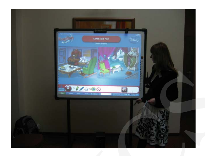
Fig. 3. Working with an interactive whiteboard with educational software.