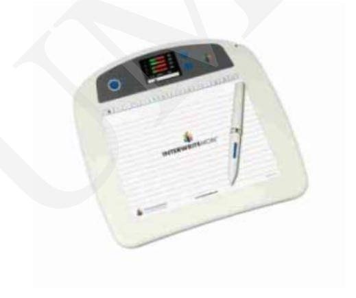
Fig. 2. Wireless tablet Interwite Mobi produced by Interwrite Learning.

The teacher's tablet provides a full, though discreet control over students' work. Due to the fact that the teacher can see answers entered by students on the display, s/he can assess the results immediately upon completing the task and discuss errors with particular students.