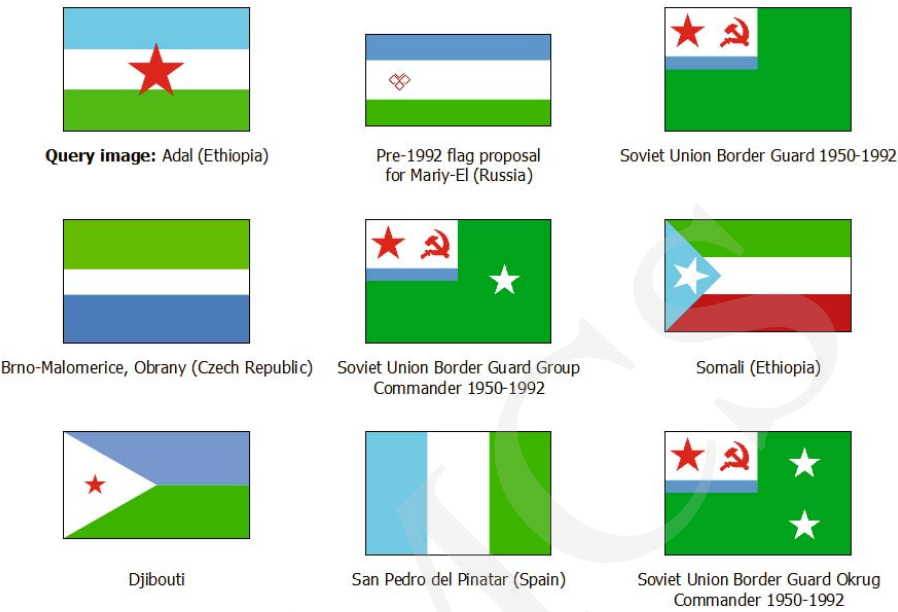
Fig. 2. Sample retrieval results. The most up-right image is a query object.