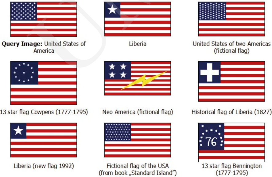
Fig. 3. Sample retrieval results. The most up-right image is a query object.