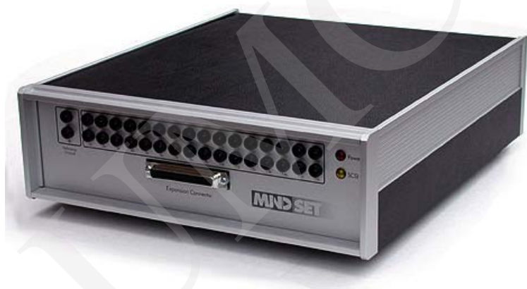
Fig. 1. Mindset MS-1000 EEG System.

MindSet MS 1000, manufactured by Nolan Computer Systems, is used as the hardware source of an EEG signal (Fig. 1). It is a real-time device containing a 16-channel analogue differential amplifier which receives signals from cap electrodes and amplifies them 32000 times. An amplified analogue signal is converted into a digital one as it goes through sample-and-hold circuits and an analogue-to-digital converter. Inside the device, there is a 32kB RAM buffer enabling it to withstand arrhythmical cooperation with a PC [9].