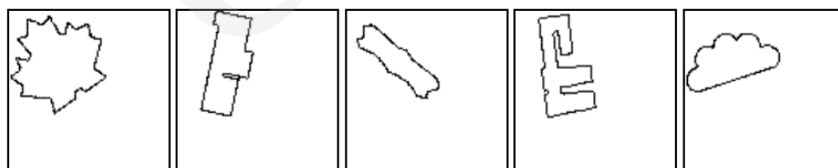
Fig. 4. Some exemplary test objects in the experiment exploring the influence of scaling

The last experiment explored the influence of scaling on the recognition results. This time, two separate values of deformation were utilized. At first the test objects were twice diminished, then twice enlarged. That gave 100 instances of test objects. A few of them are presented in Fig. 4. This time the recognition rate was equal to 91%. As it turned out, the reduction in size was much more difficult to handle (8 incorrect matches) than enlargement (only 1). It can be explained by small sizes of the resulting objects. Part of an image with the test trademark was only 50 by 50 pixels in size. Therefore, the results can be nevertheless assumed as satisfactory.