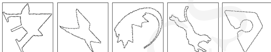
Fig. 3. Some exemplary rotated test objects in the second experiment

In the second experiment 50 trademarks rotated by a random angle were tested. Additionally, noise influenced a silhouette. This time, two objects were not recognized properly. A few examples of tested objects are provided in Figure 3.