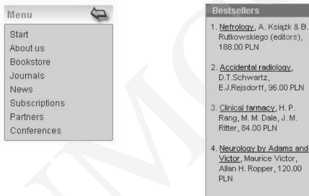
Fig. 2. The exemplary bricklets with different Decorator pattern applied

The documents set model allows to present content of some set as a bricklet [4]. The bricklet usually contains a list of documents or links placed in a given set. Depending on the renderer assigned to a certain set, the content of this set can be also rendered as an image with a name of document. If some options are set, the renderer also allows to display some additional metadata that describe the document. Nevertheless, the renderer is responsible only for the content visualization.