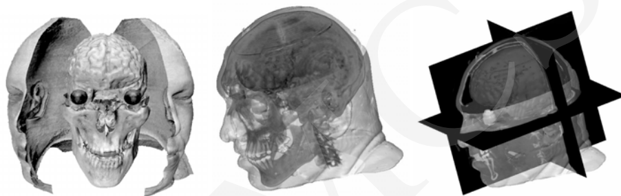
Fig. 3. Three-dimensional visualization techniques: (from left) surface rendering, combination of volume and surface rendering, 3D-slices combined with surface rendering

been performed on a PC system (Athlon XP 3200+ 2.2 GHz, 512 MB RAM). The matching process of the MRI and RGB datasets using the mutual information measure and the Powell's optimization method took 20 minutes 41 seconds (two-step rigid and affine multi-resolution approach) and required 2531 evaluations of the mutual information objective function. In the second case (CT and RGB datasets) the total running time took 4 hours 50 minutes 4 seconds (two step multi-resolution approach) and the mutual information function has been evaluated 1735 times.