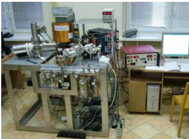
Figure 1: Overall view on the 60° magnetic sector mass spectrometer. The inlet system is installed at the front of this picture. The ion source is on the right side and the collector assembly on the left. The mass spectra and isotope analyses are computer controlled.

In Fig. 2 is shown the triple collector assembly dedicated for simultaneous collection of the 3 isotopes in S^- spectrum. The same slit system can be used for positive ions of O_2^+ .